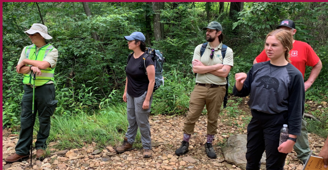
AHC staff along with other partners discuss program in archaeological site