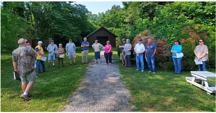
Pond Spring headstone cleaning class