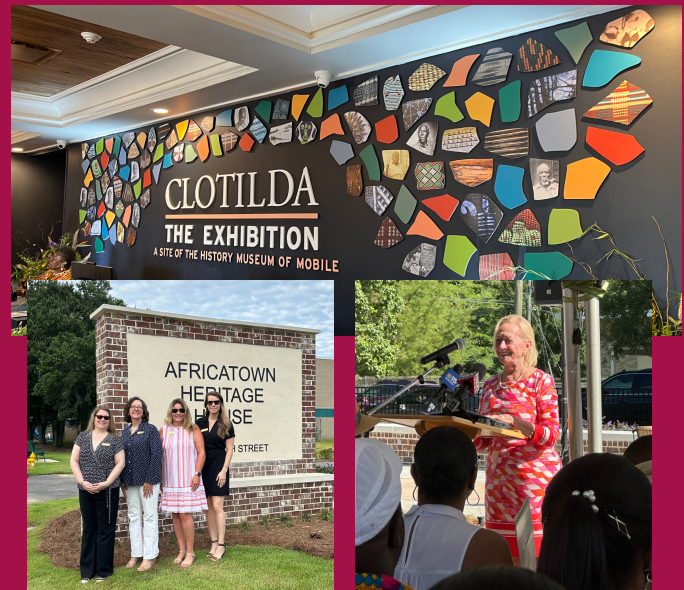
AHC staff at Africatown Heritage House

AHC donated funds towards the museum as well as loaned various artifacts and assisted with the historical text panels within the museum.